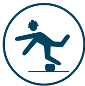
FALL AT SAME LEVEL