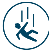
FALL FROM HEIGHT